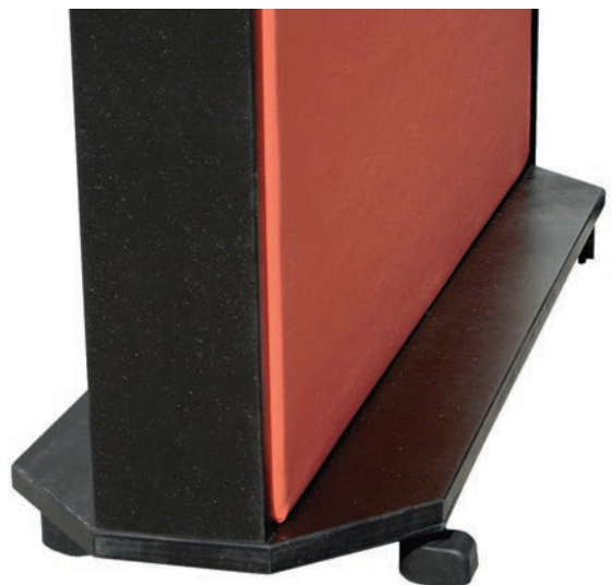
ground plate with four castors