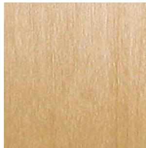
UNIFORM WHITE BIRCH